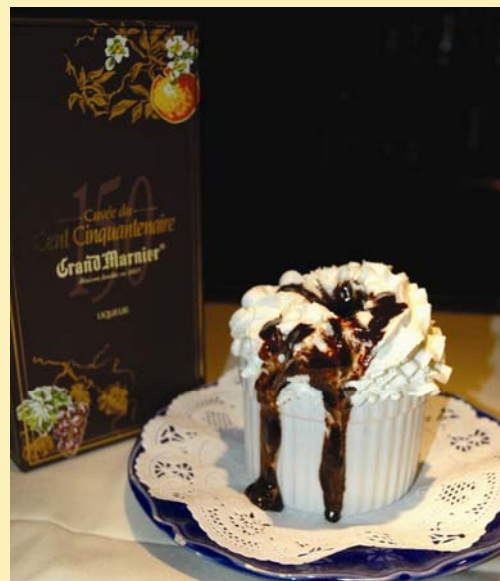
Le Chocolate Soufflé