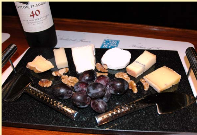
Les Fromages at Bistro le Crillon

FRENCH VALRHONA DARK CHOCOLATE SOUFFLE (20 Min.) serves 2 $15.00